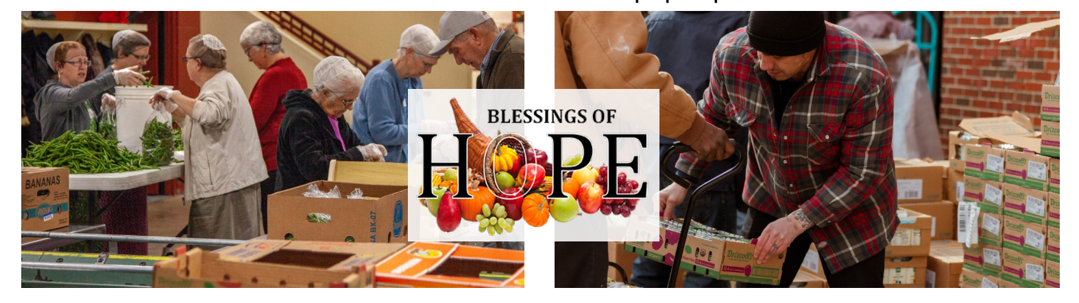
Four Seasons Family of Companies donated over 4 million lbs of surplus fresh food to Blessings of Hope in 2023. There, the food is sorted and redistributed to food pantries and non-profits or put into community food boxes.