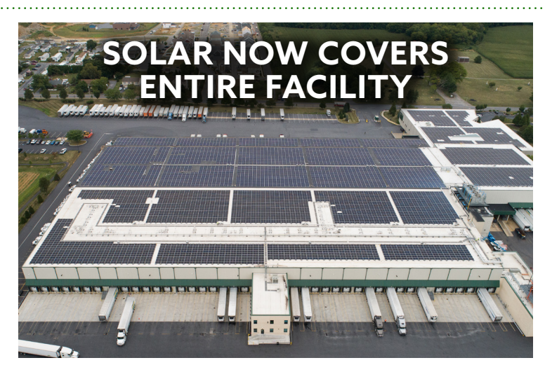
In 2023, 1,360,432 kWh were produced by our solar array.

In the spring of 2024, a new 1,700,000 kWh solar array was commissioned, bringing solar electricity to 35% of facility needs and allowing energy to be sold back into the grid on sunny days.