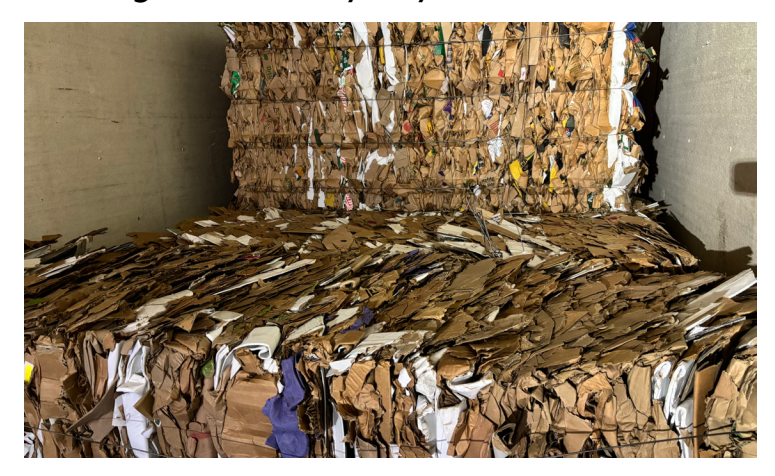
1,234,450 lbs of Corrugated Cardboard recycled in 2023 to be turned into other cardboard and paper products