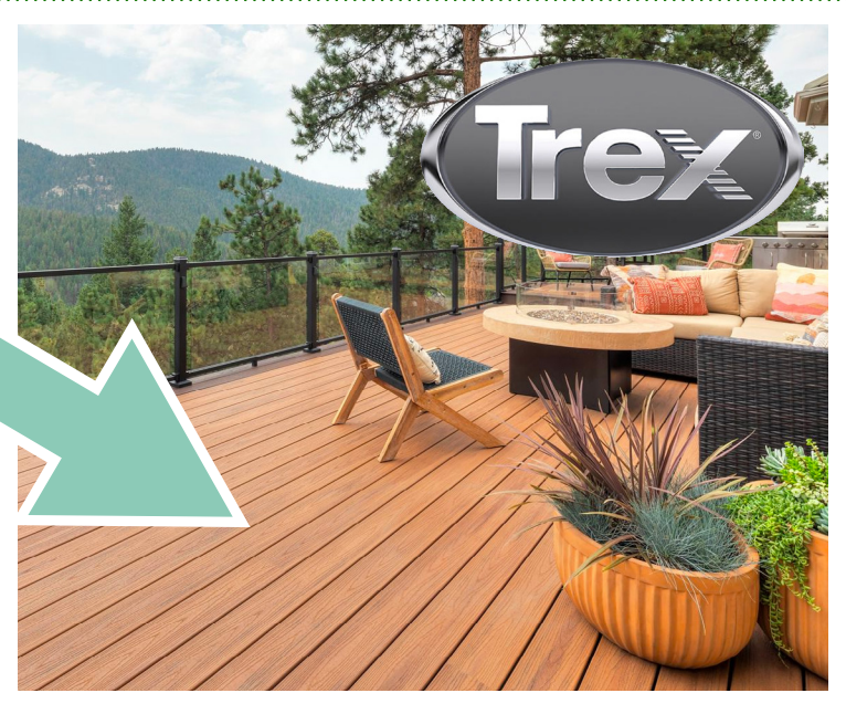
95,210 lbs of Shrink Wrap and Plastic sent to Trex in 2023, and turned into composite decking and composite outdoor furniture