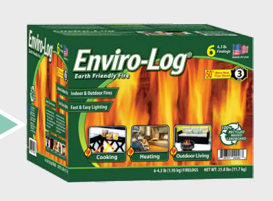
129,125 lbs of Waxed Cardboard in 2023 sent to Enviro-Log and turned into fireplace logs