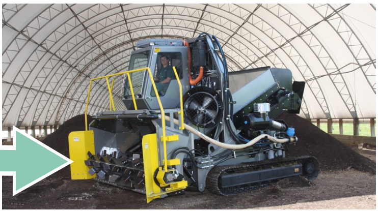
1,410,000 lbs of Surplus Produce No Longer for Consumption sent to a local composting operation in 2023